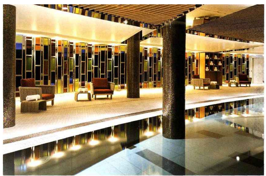
Take a dip in the Les Neiges indoor pool (above) and hit the slopes in style with ski wear from Bernard Orcel (below)

Spa at Le Strato Hotel, where the signature massage, simply named Le Strato, uses a toning oil made with a blend of essential oils to help you relax. The highlight of the signature massage though is when the masseuse simultaneously massages one side of your shoulders and one ankle, leaving you in a relaxation coma.